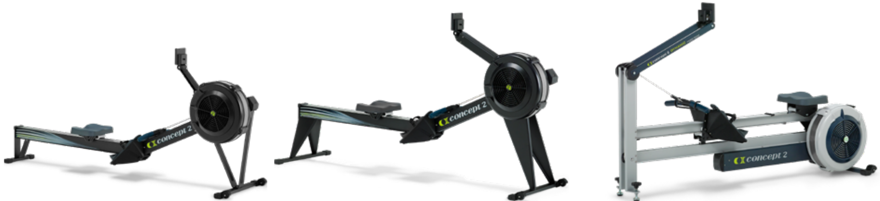
Model D RowErg