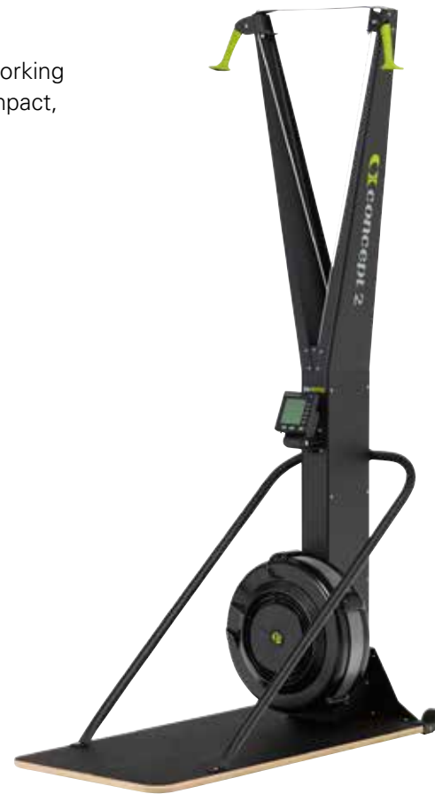
SkiErg with Floor Stand

The Concept2 SkiErg makes the terrific exercise of Nordic skiing available to everyone. It helps build strength and endurance by working the entire body in an efficient, rhythmic motion. Skiing is a low-impact, high calorie-burning exercise suitable for all ages and abilities.