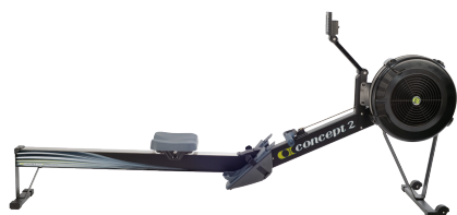
Model D (Shown in Black)

All prices are in US dollars and are subject to change without notice. Shipping and taxes (where applicable) additional.