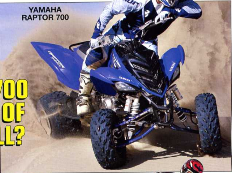
YAMAHA RAPTOR 700